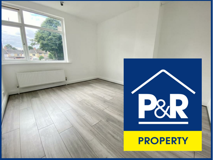
6 Preston Gardens, Luton, Bedfordshire, LU2 7NL £1,250 PCM